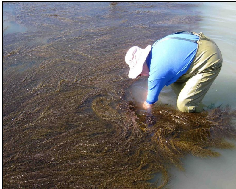
Sargassum muticum control Louisa Bay