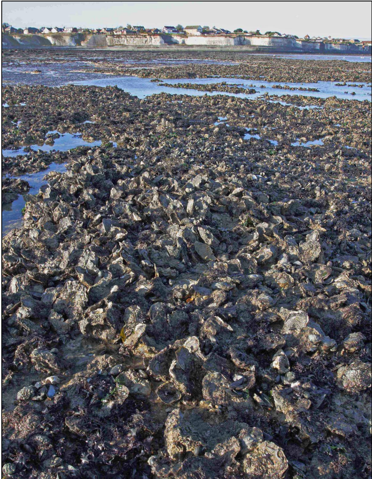
Pacific Oyster reef. Epple Bay, Birchington