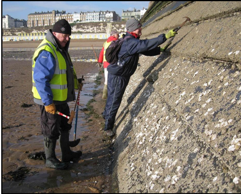
Magallana gigas control Broadstairs Harbour